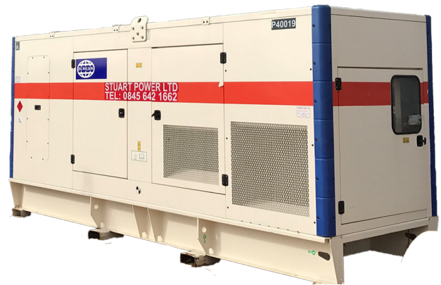
Generator shown is indicative and may not be representative of equipment available at the time.