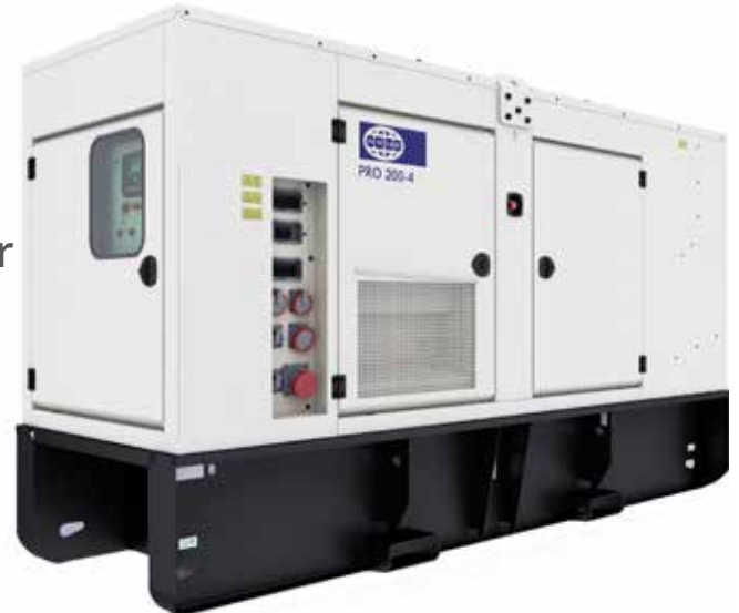
Generator shown is indicative and may not be representative of equipment available at the time.