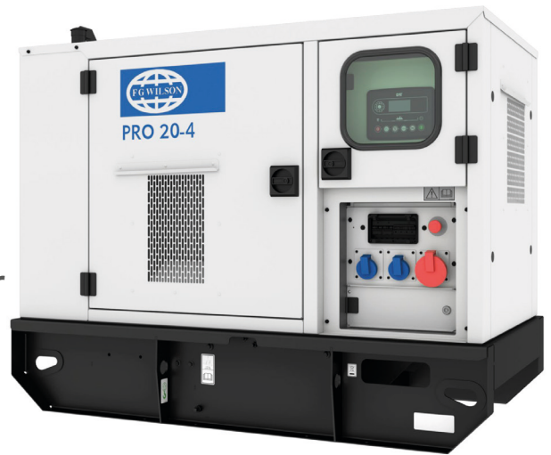
Generator shown is indicative and may not be representative of equipment available at the time.