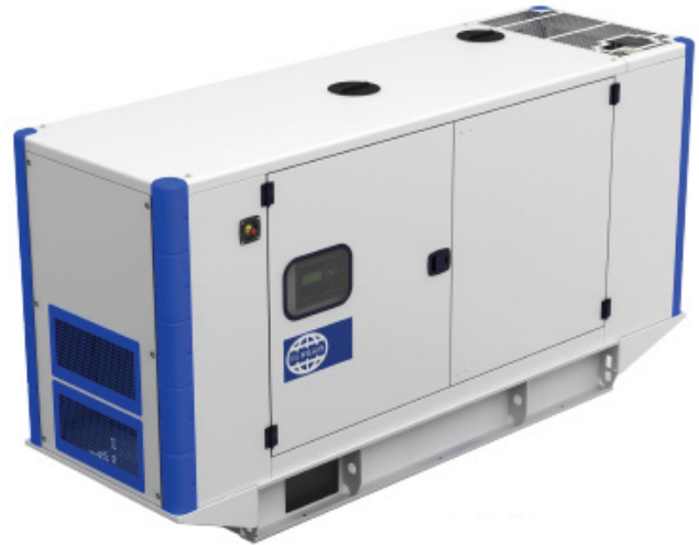
Generator shown is indicative and may not be representative of equipment available at the time.