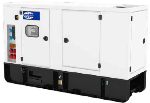
Generator shown is indicative and may not be representative of equipment available at the time.