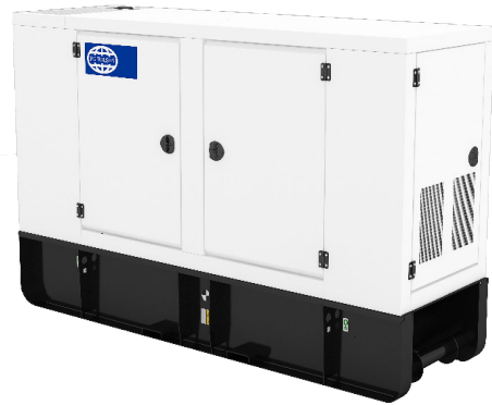
Generator shown is indicative and may not be representative of equipment available at the time.