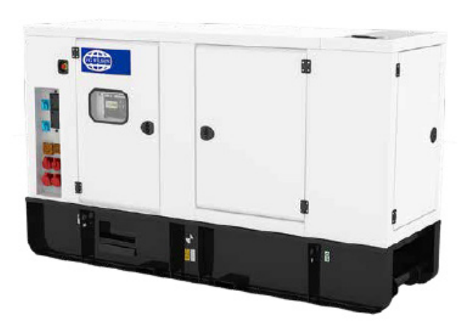
Generator shown is indicative and may not be representative of equipment available at the time.