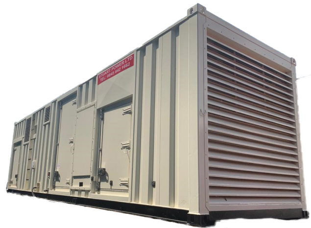
Generator shown is indicative and may not be representative of equipment available at the time.