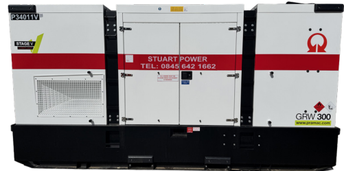
Generator shown is indicative and may not be representative of equipment available at the time.