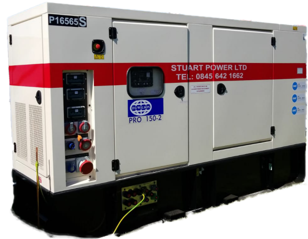
Generator shown is indicative and may not be representative of equipment available at the time.