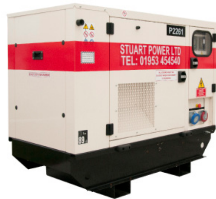
Generator shown is indicative and may not be representative of equipment available at the time.