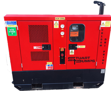
Pump shown is indicative and may not be representative of equipment available at the time.