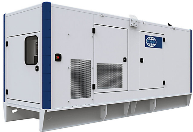
Generator shown is indicative and may not be representative of equipment available at the time.