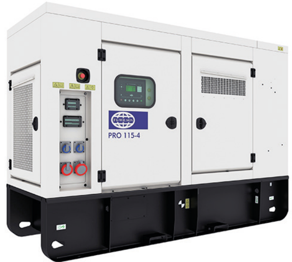
Generator shown is indicative and may not be representative of equipment available at the time.