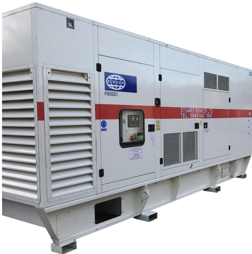
Generator shown is indicative and may not be representative of equipment available at the time.