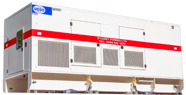
Generator shown is indicative and may not be representative of equipment available at the time.