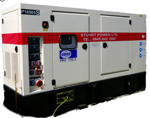
Generator shown is indicative and may not be representative of equipment available at the time.