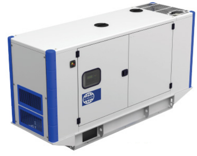
Generator shown is indicative and may not be representative of equipment available at the time.